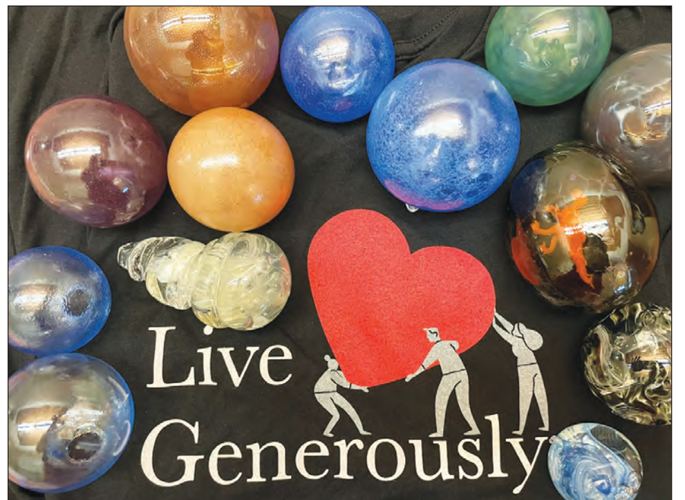
Future Neenah photo

Orbs will only be hidden on public areas along the Neenah portion of the loop between Herb & Dolly Smith Park